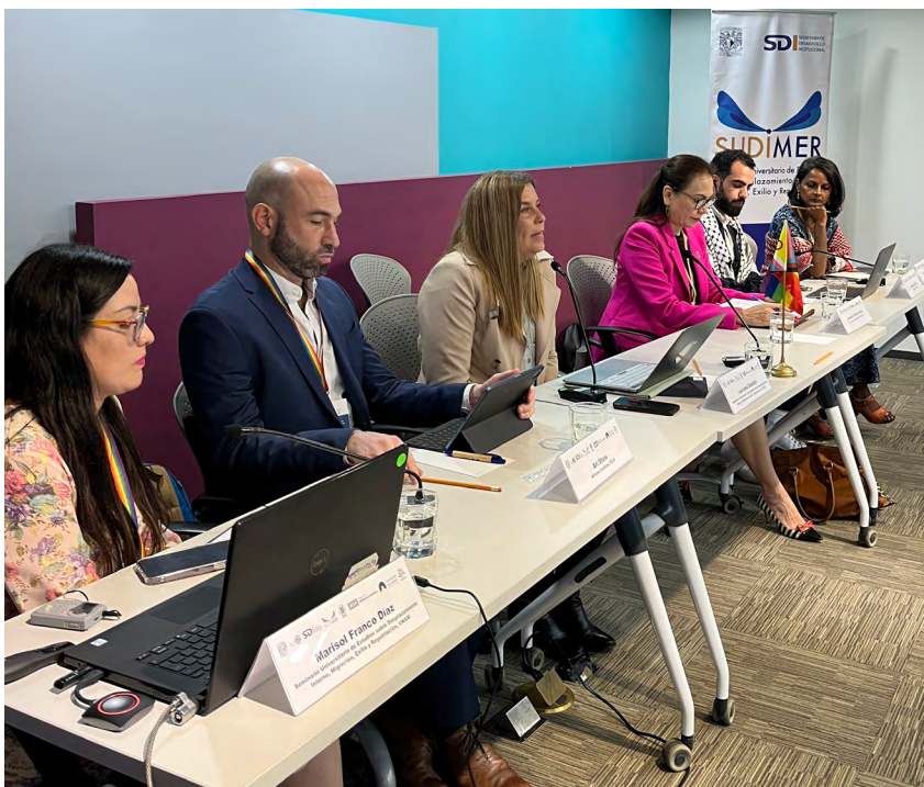
Presenters and conference organizers during opening plenary session of the conference.