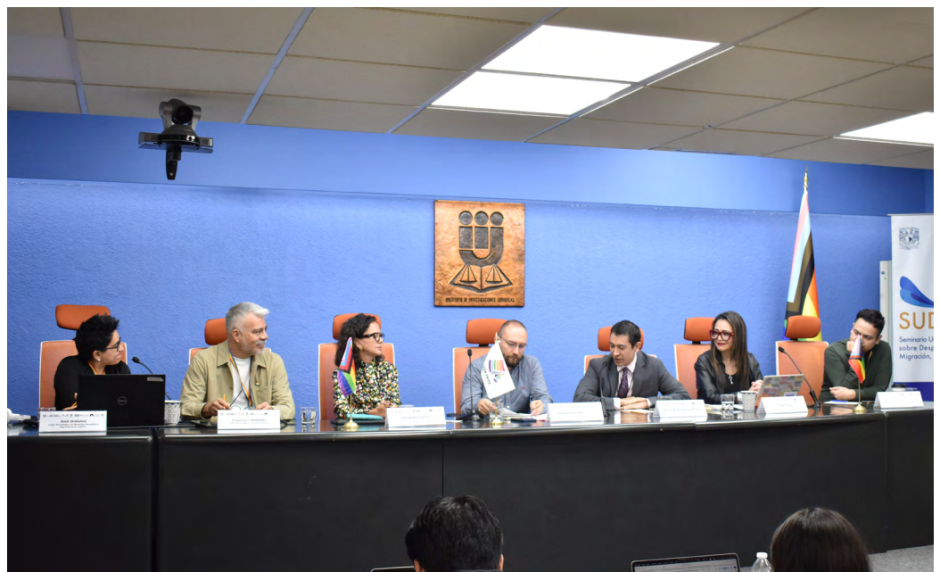
Panelists during plenary session, Plenary session: Mexico City: A City of Reception and Sustainable Local Integration for LGBTIQ+ Persons in Situations of Forced Displacement

Based on pre-event surveys completed by 52 attendees, the participant profile was notably diverse. Attendees represented citizenship from 22 different countries, with the largest contingents originating from Mexico, the United States, and Canada. The group encompassed a wide spectrum of gender identities, including cisgender, transgender, non-binary, and genderfluid individuals, as well as various sexual orientations. Professionally, the majority identified as activists or human rights defenders (27), representatives of Civil Society Organizations (23), along with academics (13) and government officials (4). Importantly, 11 respondents indicated personal lived experience of forced displacement, primarily as asylum seekers or recognized refugees, thereby ensuring that their perspectives were integral to the discussions.