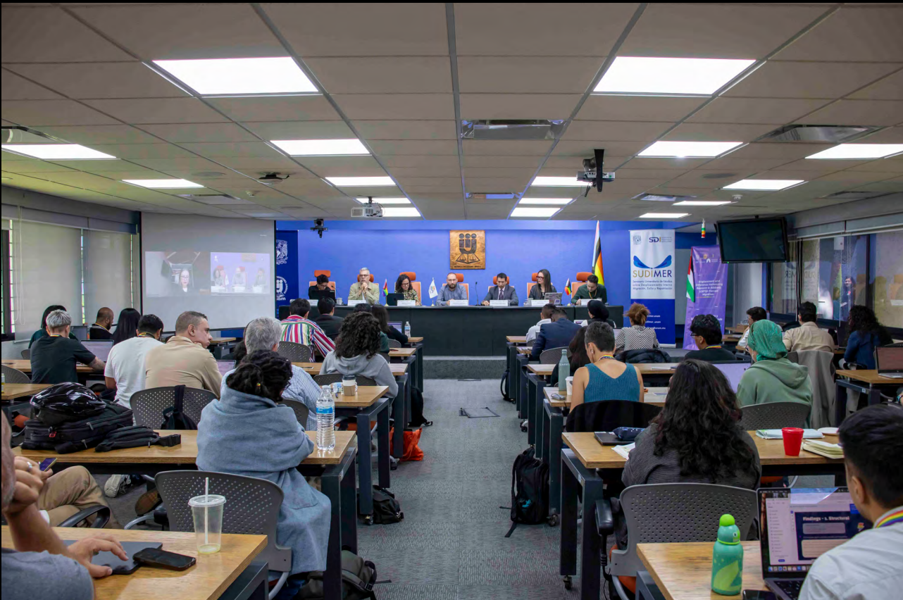
Presenters and participants during plenary session of the conference.

The struggles for the human rights and freedoms of displaced LGBTQI+ individuals persist. The network established here is merely the inception of a broader, deeper, and more transformative collaboration. The symposium concluded not with an ending, but with a collective promise to continue dreaming, resisting, and formulating strategies that uphold the rights of all displaced queer individuals to a safe and dignified future.