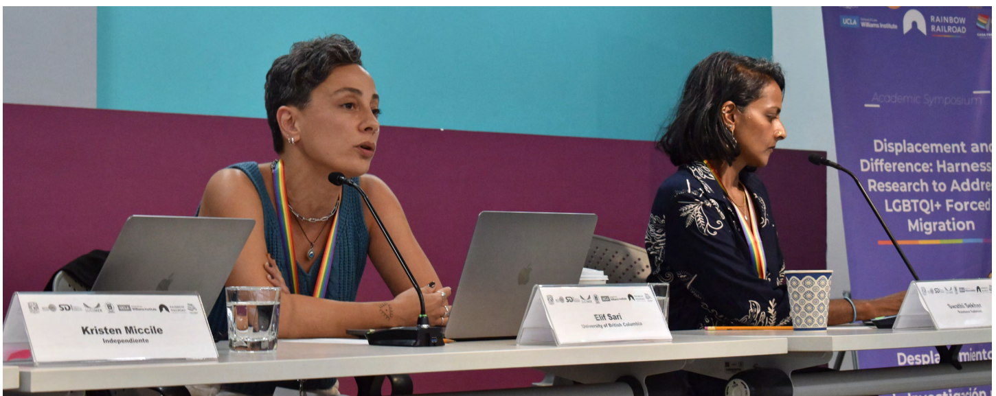
Panelist and moderator presenting during panel, Resettlement and Relocation Dynamics